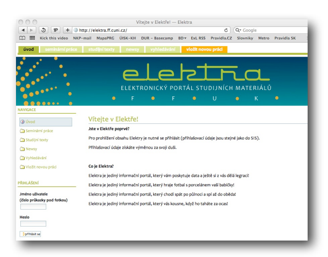
Figure 3: Elektra Homepage

The Faculty of Arts, in coordination with the Computer Centre, has recently decided to make things easier and created a common portal for submitting, sharing and accessing seminar paper as well as study materials (unpublished materials written by teachers, lecture notes, scanned papers, etc.).